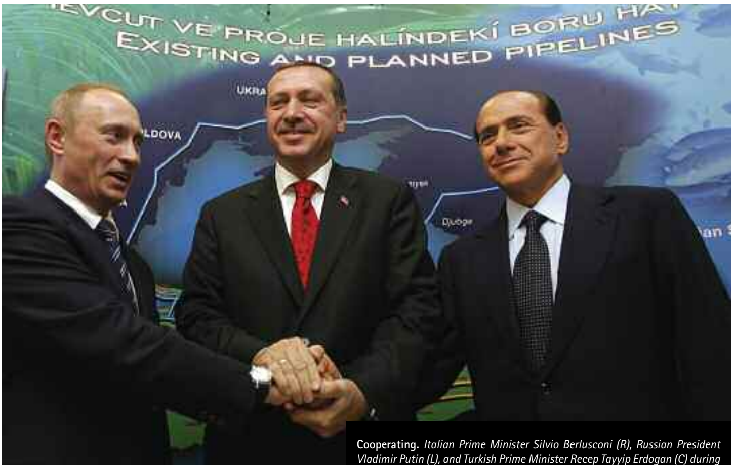
Cooperating. Italian Prime Minister Silvio Berlusconi (R), Russian President Vladimir Putin (L), and Turkish Prime Minister Recep Tayyip Erdogan (C) during the inauguration ceremony for the Natural Gas Pipe Line, "Blue Stream," from Russia to Turkey through the Black Sea.