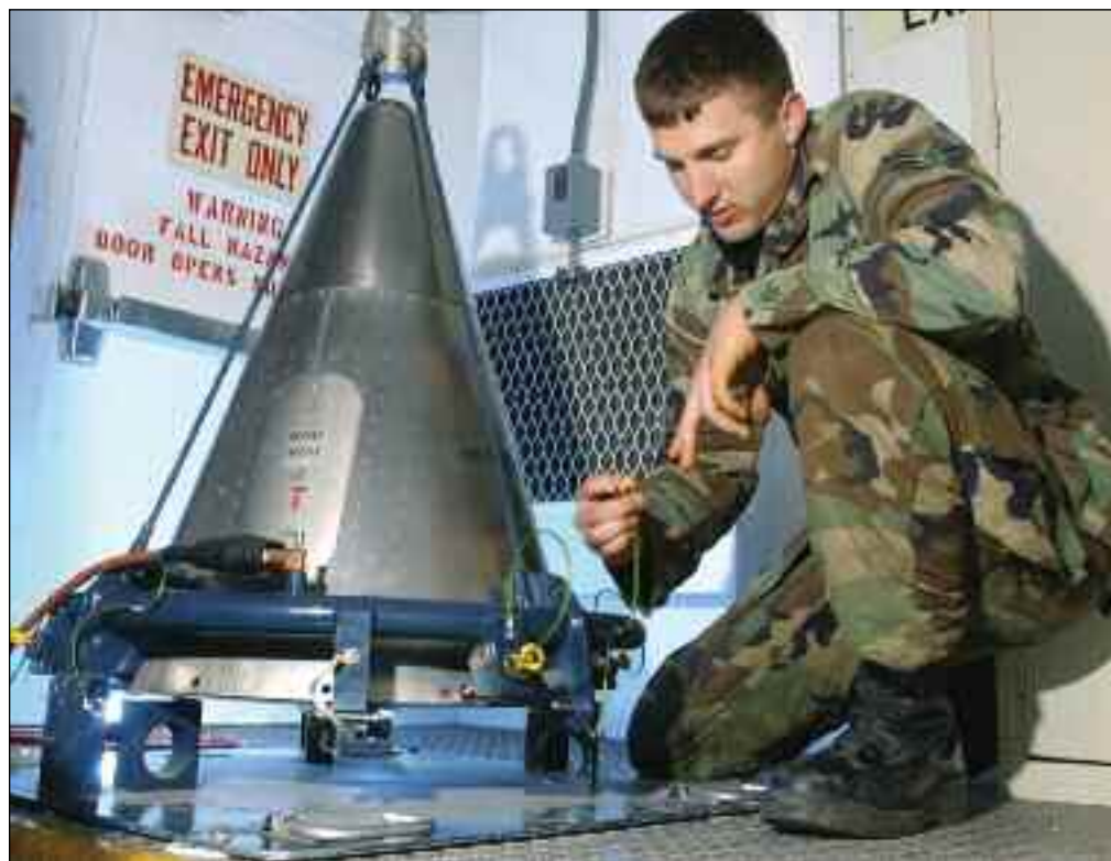
Fewer of These? A missile maintenance technician inspects a pin on a Minuteman III missile component at a missile maintenance trainer here. The role of nuclear weapons in US security is under review.

Within the first year of a new presidency, the United States will have an official opportunity to adopt these